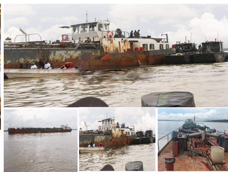
The crude oil tanker, MT Deinmo, with International Maritime Organisation (IMO) number 7210526, loaded with an unspecified quantity of crude oil at the Escravos River in Warri South West Local Government Area of Delta state, arrested by Tantita Security Personnel on Thursday, October 7, 2022.