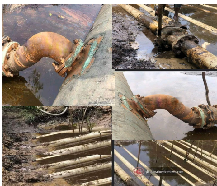
The illegal crude oil pipeline attached to the 48-inch Trans Forcados Export Trunkline through which crude oil was being diverted from a 400,000 barrel per day Forcados pipeline to the high sea for export, discovered by Tantita Security Services Nigeria Ltd (TSSNL).

It is even possible for the country to continually meet the OPEC quota for several months. But analysts are however worried that the inability to maintain the relationship (between NNPC and Tompolo) will possibly see Nigeria goes back to its usual sorry terrain.